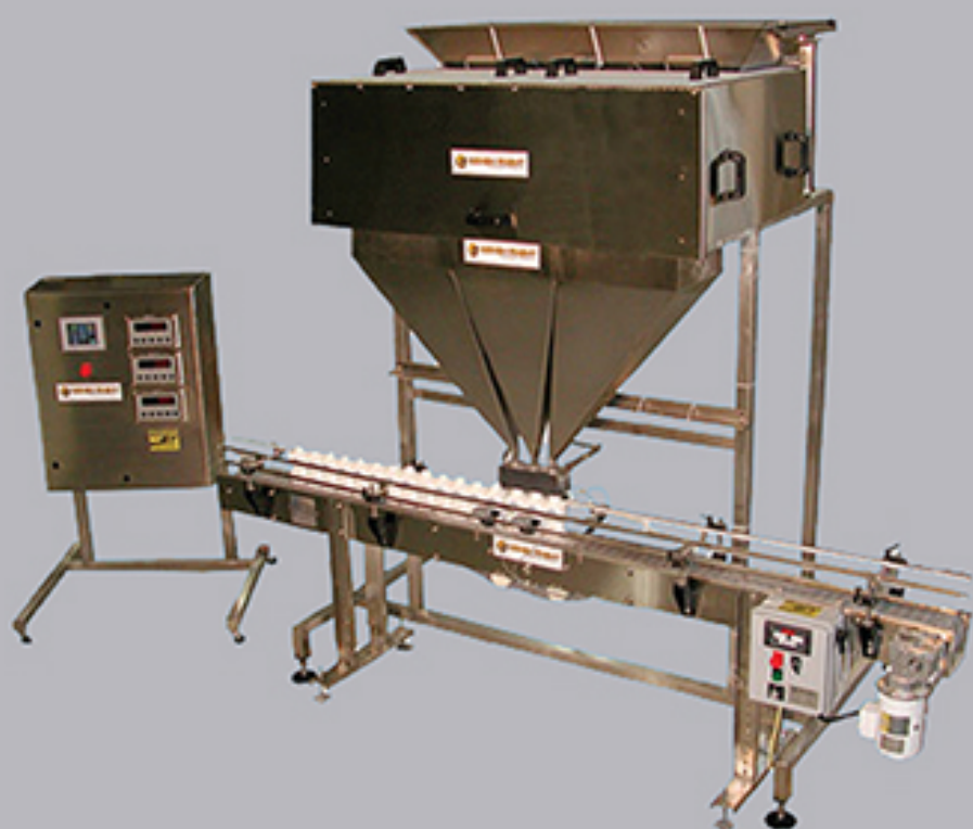
Scale with triple discharge hopper interfaced with jar indexing conveyor