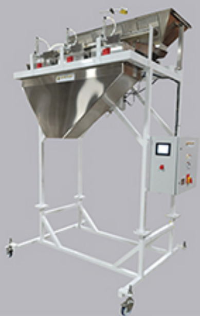
Non-washdown with frame designed to mount over a bagger