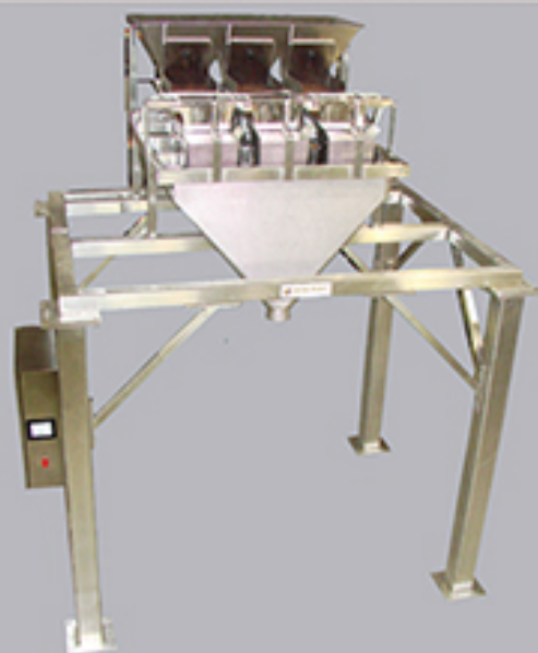
All stainless washdown with frame designed to mount over a bagger