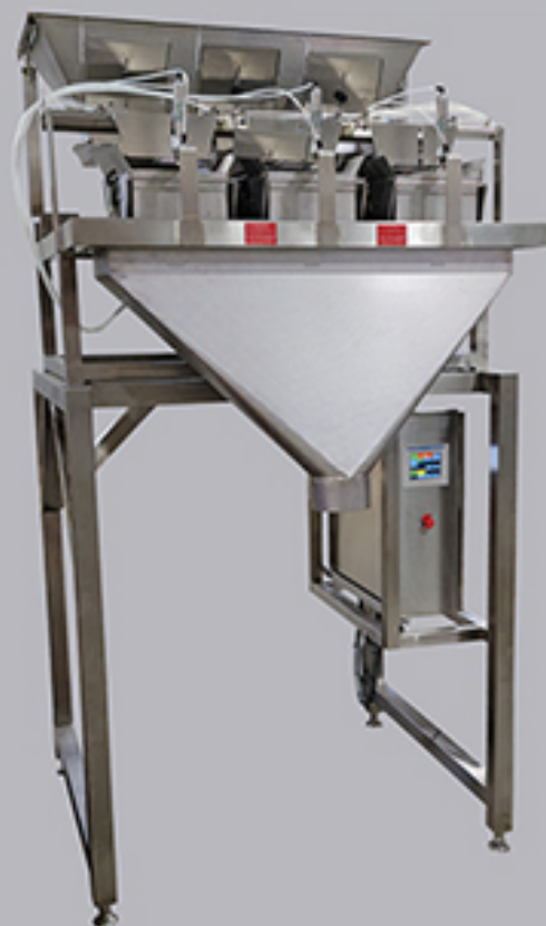
All stainless steel USDA upgrade wash down model with textured contact surfaces