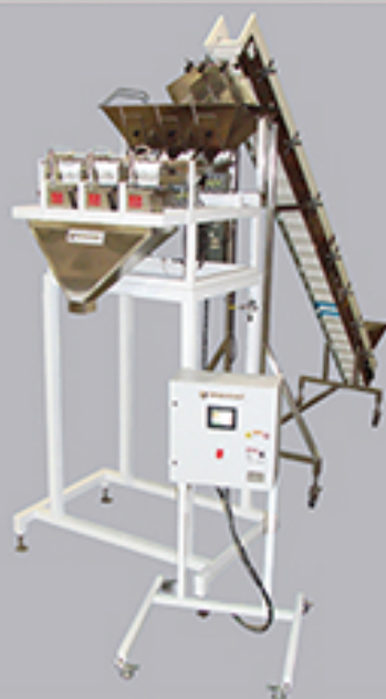
Scale fed by infeed conveyor