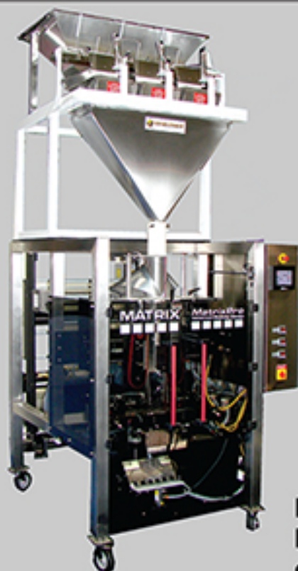
PMB-3 with bagger (made by others)