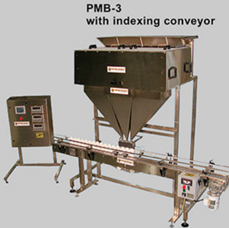
PMB-3 with indexing conveyor

MORE AUTOMATION: Add an infeed conveyor with a vibratory Stoker Feeder allowing a large volume of product to be stored and automatically fed to the conveyor.