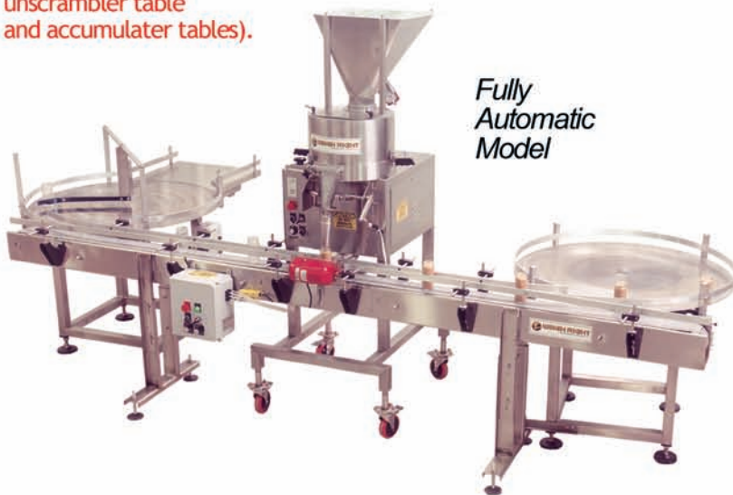
Fully Automatic Model

(Shown with optional unscrambler table and accumulator tables).