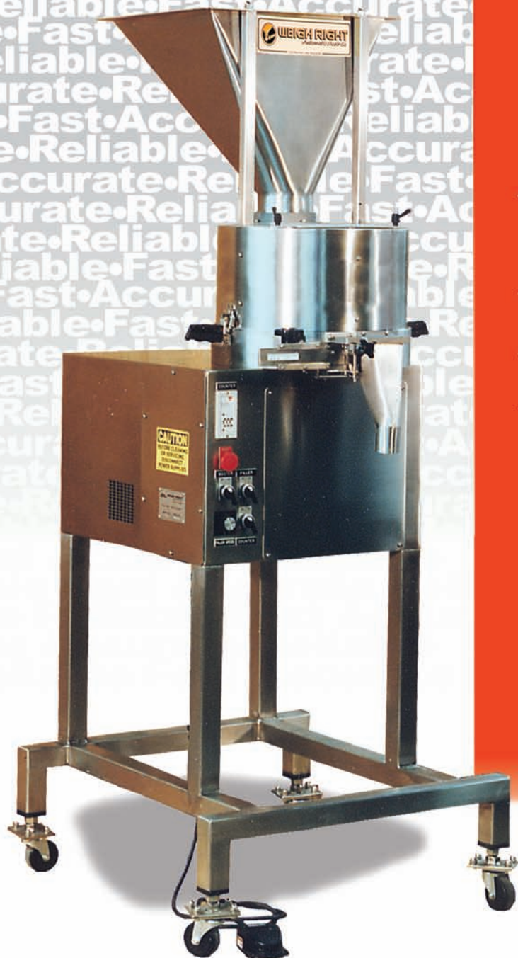
Model A Powder Filler (semi-automatic model)